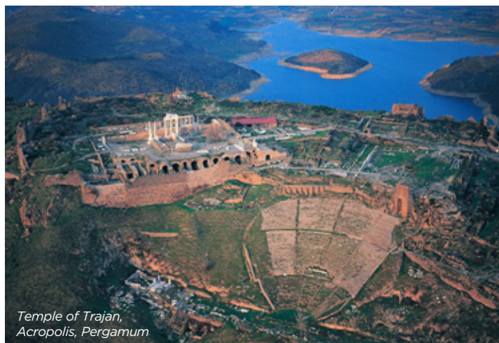
Temple of Trajan, Acropolis, Pergamon

Morning tour of Assos, Leave for Pergamon. Visit the Acropolis with the steepest theater of the ancient world and the Temple of Trajan. Then visit the Red Basilica which was an Egyptian Temple, later converted to a church. Final visit to the Askleion, the ancient Healing Center. Dinner and overnight in Bergama. (B,D)