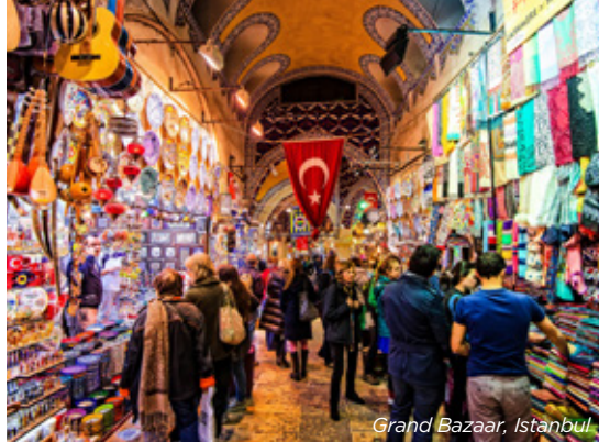
Grand Bazaar, Istanbul