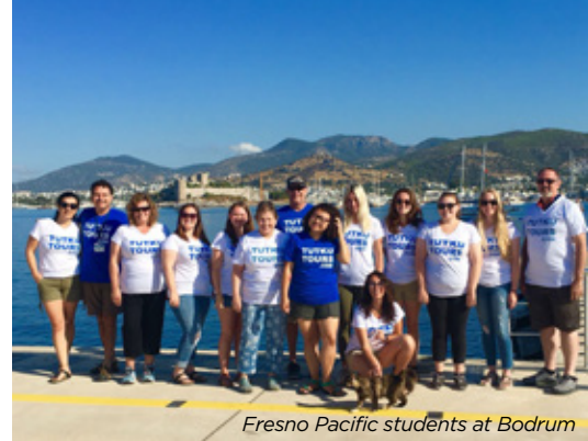
Fresno Pacific students at Bodrum