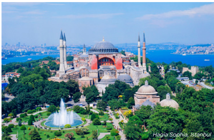
Hagia Sophia, Istanbul